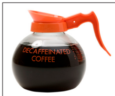
70280200406 64 oz. Glass Decanter - Decaf