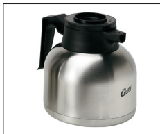
CLXP6401S000 64 oz. Stainless Steel Pourpot