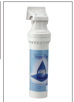
CSC10AV000 10" Vend Filter/Cartridge Assembly Complete