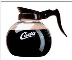
7028000306 64 oz. Glass Decanter - Regular