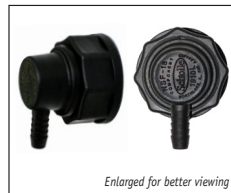
WC-8654 Scholle Connector