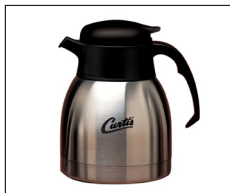
TLXP1201S000 1.2L Stainless Steel Pour Pot