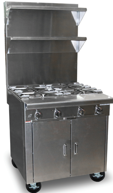
Model P32A-XX with optional 36" flue riser, optional removable cast iron grate tops and optional casters