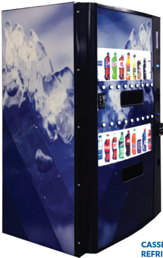
CASSETTE STYLE REFRIGERATION DECK