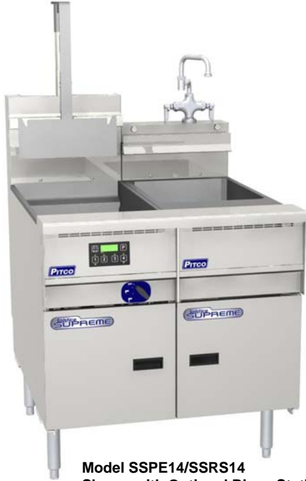
Model SSPE14/SSRS14 Shown with Optional Rinse Station Shown with option: Single Basket Lift