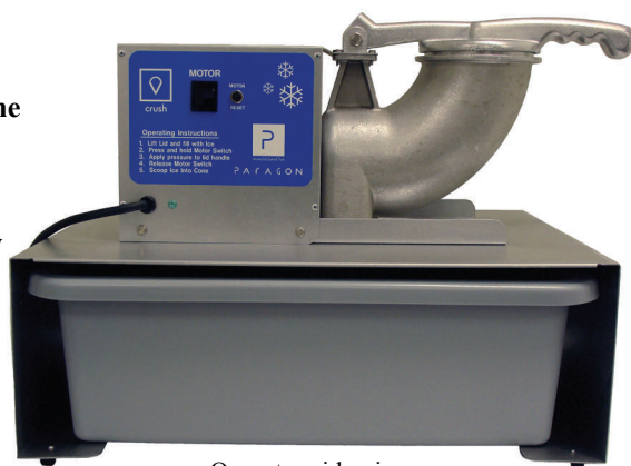
Operator side view

It uses a bus-tub for crushed ice dispensing. Utilization of a two-tub system allows two people to efficiently operate a single machine; one crushes while the other serves, and turn a huge volume in short periods. We should have called this model the “Easy Profit” machine.