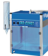
Comes with cup dispenser