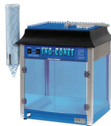
Comes with cup dispenser