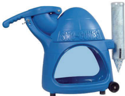
Comes with cup dispenser