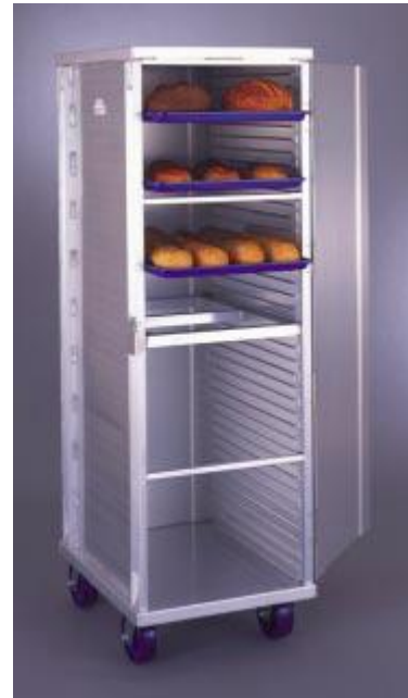
#1290PP • #1290WDW • #1292 Enclosed Pan Rack

All units carry a Lifetime Guarantee against rust and corrosion as well as a Five-Year Guarantee against material defects and workmanship.