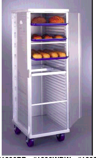
#1290PP • #1290WDW • #1292 Enclosed Pan Rack

All units carry a Lifetime Guarantee against rust and corrosion as well as a Five-Year Guarantee against material defects and workmanship.