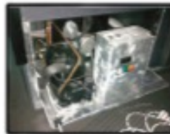
PULL OUT CONDENSING UNIT ON SELF CONTAINED