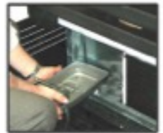
PULL OUT EVAP PAN FOR EASY CLEANING ON SELF CONTAINED