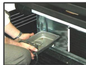
PULL OUT EVAP PAN FOR EASY CLEANING