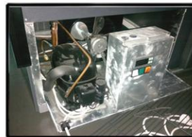
PULL OUT CONDENSING UNIT