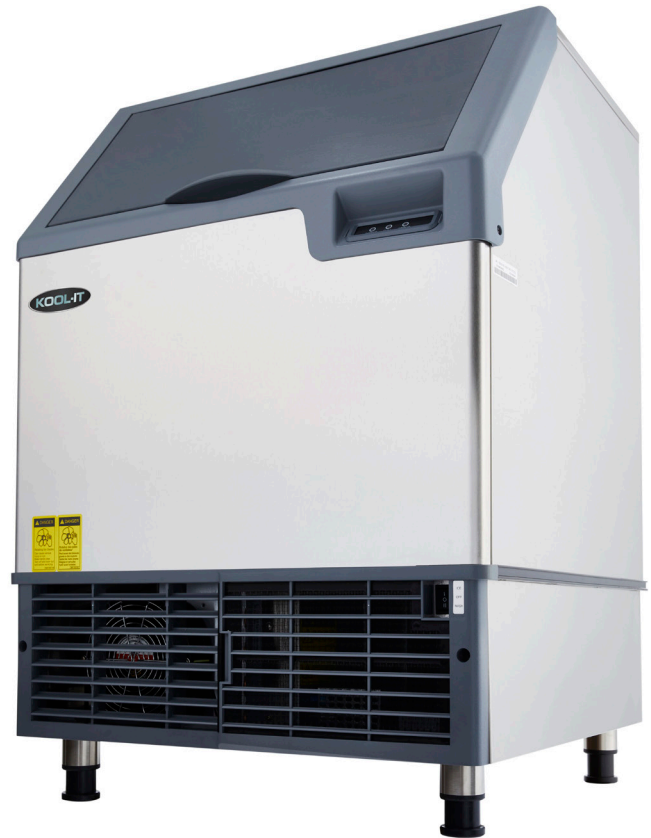
Half Cube Dimensions