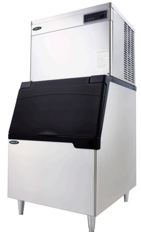
Bin KB-350 shown above is not included - sold separately