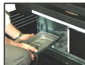
PULL OUT EVAP PAN FOR EASY CLEANING