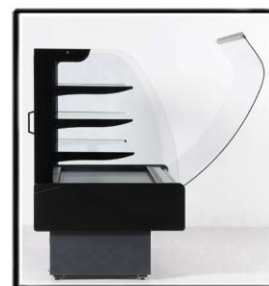
TILT FORWARD FRONT GLASS