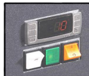
DIGITAL CONTROLLER WITH HIGH PRESSURE ALARM