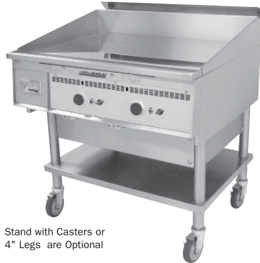
Stand with Casters or 4" Legs are Optional

The Keating MIRACLEAN® Griddle is designed to provide maximum performance with many benefits to the operator. The mirror surface is achieved in a special eight step process. High input burners rated at 30,000 BTU/hr. for natural gas are mounted every 12" to ensure performance and recovery allowing the operator to use zone cooking for different products.