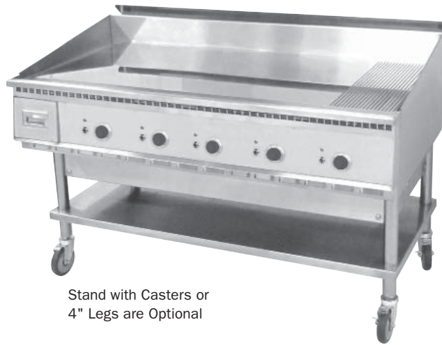
Stand with Casters or 4" Legs are Optional

The Keating MIRACLEAN® Griddle is designed to provide maximum performance with many benefits to the operator. The mirror surface is achieved in a special eight step process. Insulated stainless steel electric elements are mounted every 12" to ensure performance and recovery allowing the operator to use zone cooking for different products.