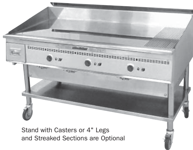
Stand with Casters or 4" Legs and Streaked Sections are Optional

The Keating MIRACLEAN® Griddle is designed to provide maximum performance with many benefits to the operator. The mirror surface is achieved in a special eight step process. High input burners rated at 30,000 BTU/hr. for natural gas are mounted every 12" to ensure performance and recovery allowing the operator to use zone cooking for different products.