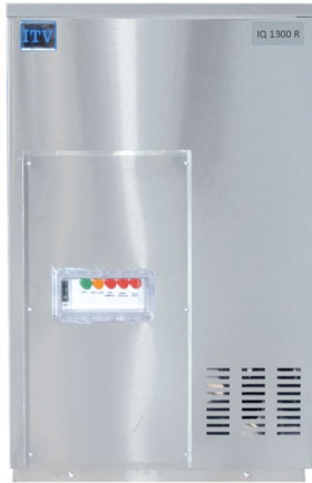
IQ 1300 R