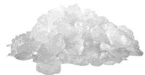
ICE QUEEN Flakes