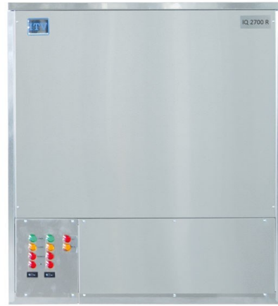
IQ 2700 R