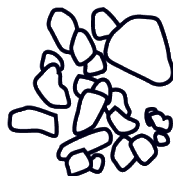
"Fine" Style Ice Flakes