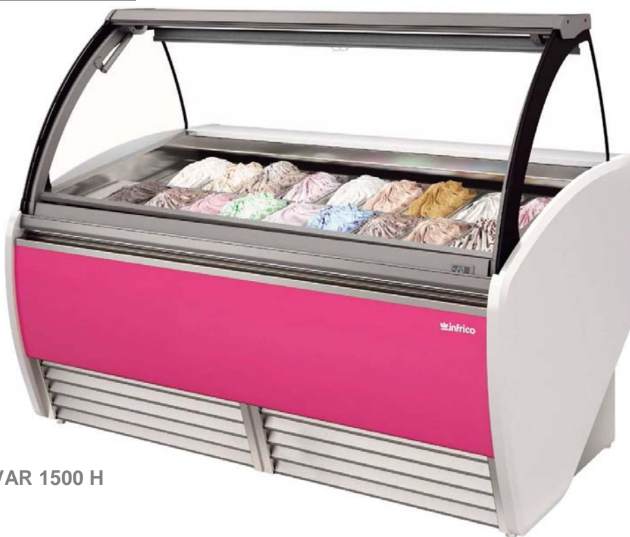
VAR 1500 H