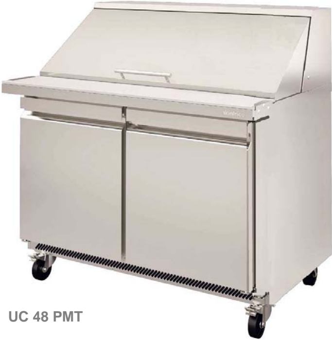
UC 48 PMT