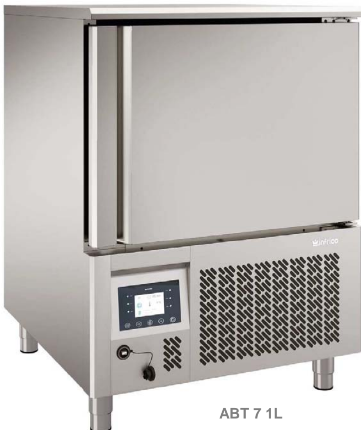
ABT 7 1L