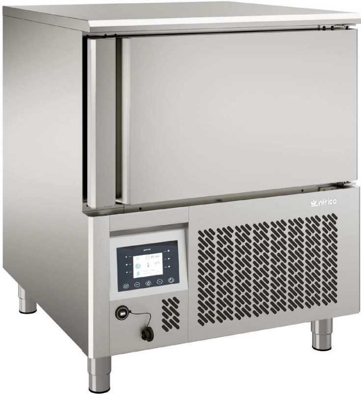
ABT 5 1L