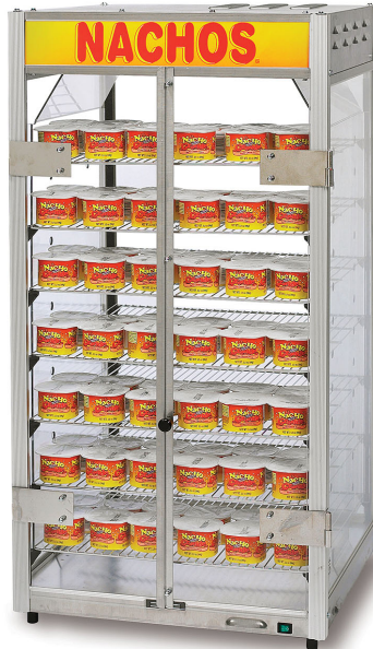
General image shown for reference only.