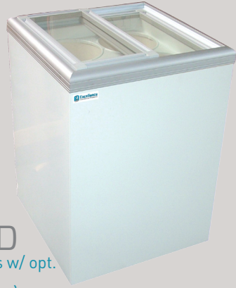
ISL 5D (Glass lids w/ opt. can holders)