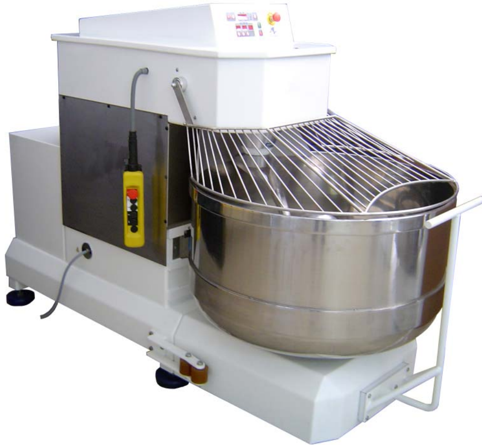
ATA100 - ATA150