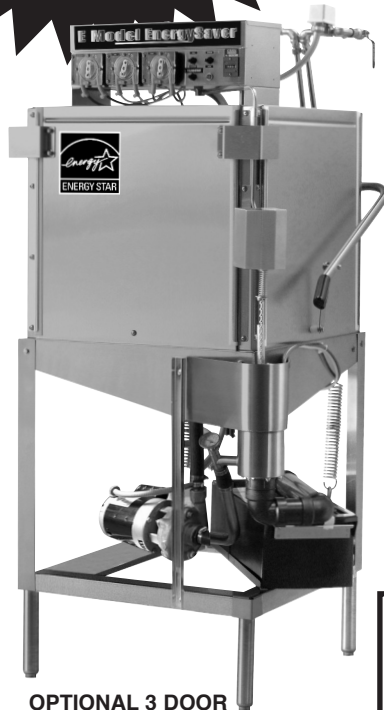
OPTIONAL 3 DOOR MODEL AVAILABLE FOR STRAIGHT AND CORNER OPERATION