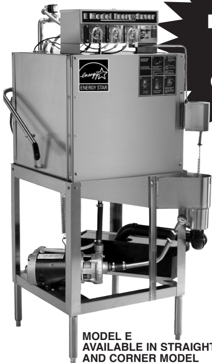
MODEL E AVAILABLE IN STRAIGHT AND CORNER MODEL

USES ONLY 1.01 Gallons Of Water Per Cycle!