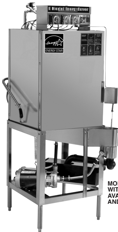
MODEL E EXT WITH 20-1/2" DOOR OPENING AVAILABLE IN STRAIGHT AND CORNER MODEL