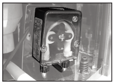
Built-in detergent and rinse chemical pumps.