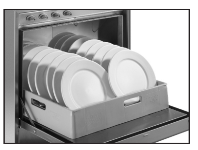
Large 13" maximum loading height door clearance accommodates oversized plates, glasses and utensils.