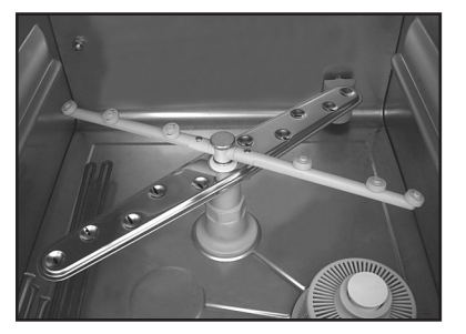
Upper and lower wash and rinse arms guarantee excellent results.