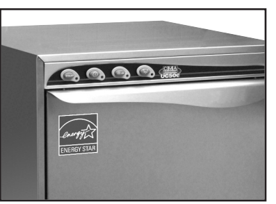
Top mounted controls are easy to read and simple to operate.