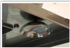
Convenient Snow Cone Shaper