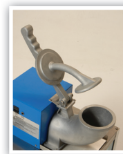
Cast Aluminum Assembly