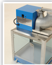
Polycarbonate Service Door