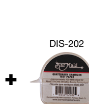
Bar Maid Sanitizer Test Strips