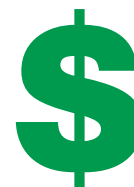
MORE PROFIT with Bar Maid