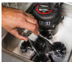
Bar Maid Professional Electric Glass Washer