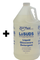
Bar Maid LoSUDS Detergent