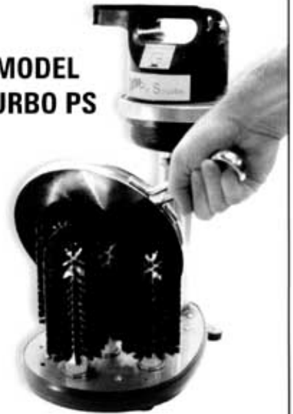
MODEL TURBO PS