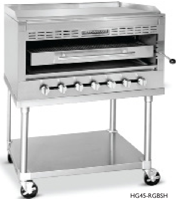
HG45-RGBSH Shown with optional casters and stand.