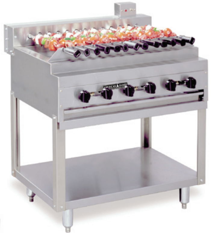
Model ARKB-36-R Shown with optional rotisserie and stand.