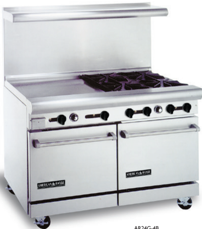
AR24G-4B Shown with optional casters