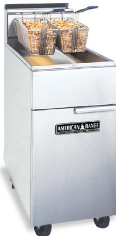
AF-25/25 Shown with optional casters